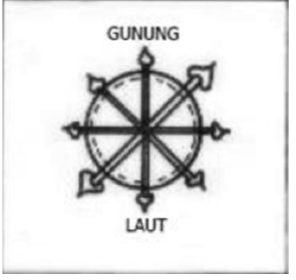
Gambar 4. Sanga Mandala

In terms of its categorization, the lexicon of sanga mandala is categorized in the noun category. The lexicon of sanga mandala is a compound form because it consists of two leksem namely sanga 'nine' mandala 'territory'. The lomaikon sanga mandala in ekoleksikal pertained in abiotic or lifeless environment. The sanga mandala that is categorized as noun is usually spoken by the elders or the elder. The speaking partner of this lexicon speaker is equivalent or younger than the speaker. This lexicon is said in situations of guidance or direction. By using the object sanga mandala is the concept of space in the traditional settlement of Bali. The speaker gives guidance or direction so that his or her younger equivalent or equivalent counterparts can apply the concept of sanga mandala so that in the making of residential house the division of residential zone can run harmoniously.